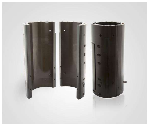
SBO HIGH SPEED SHELL HOLDER