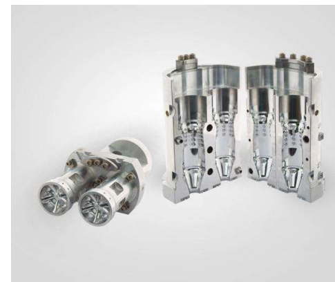
SACMI DOUBLE MOULD