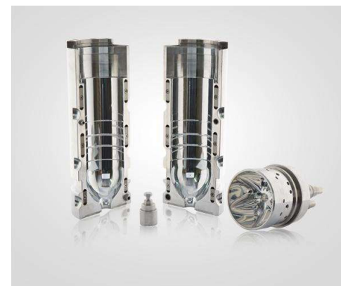
KHS HIGH SPEED MOULD