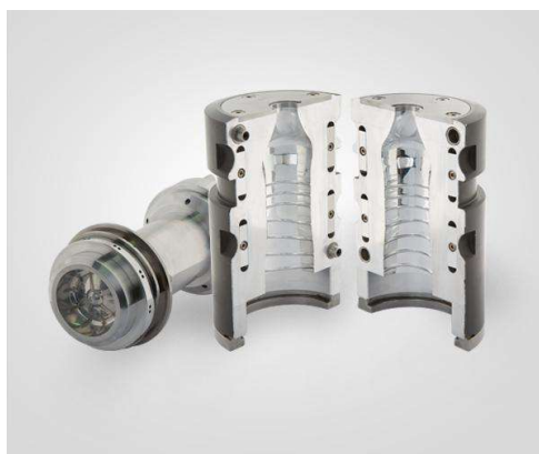
SIG BLOWMAX MOULD