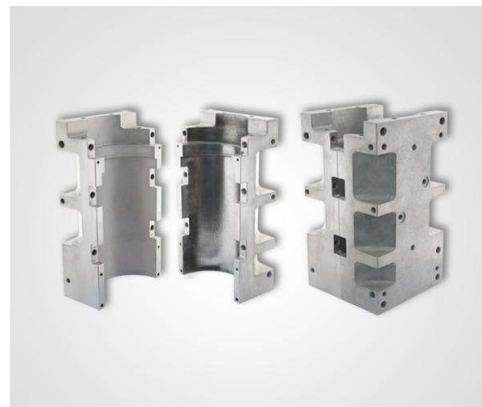
SIPA SHELL HOLDER