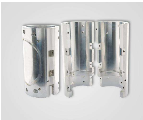
SIG SHELL HOLDER