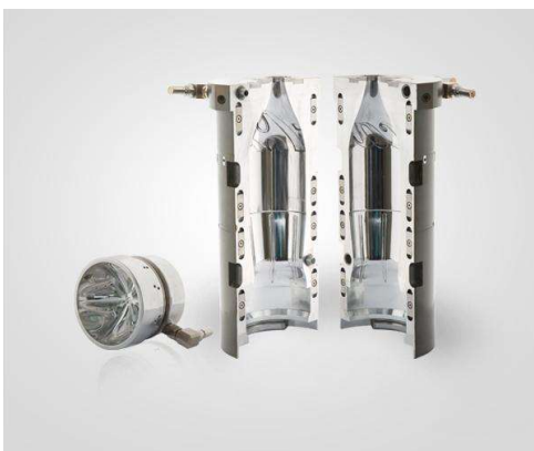
KRONES INTEGRAED SHELL MOULD