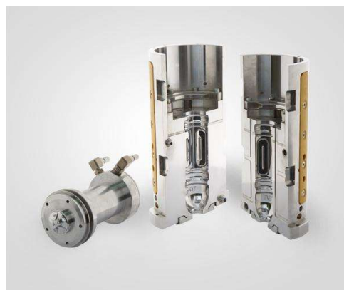
KRONES HOT FILL MOULD