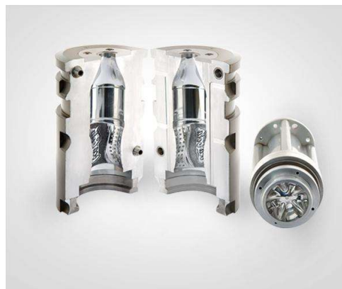
SBO CSD MOULD