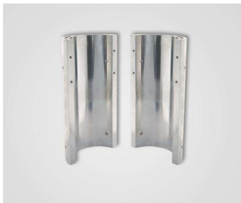
SBO SHELL HOLDER