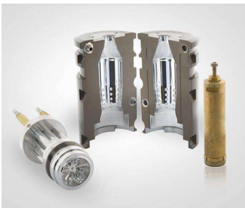
SBO HIGH SPEED MOULD