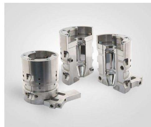
SBO HOT FILLED MOULD